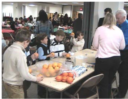
Making orange and clove air fresheners

What fun we had! Over 100 people gathered after worship on December 6 for brunch and Christmas crafts.