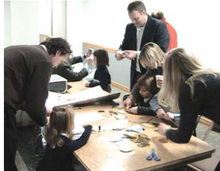
Making angel ornaments