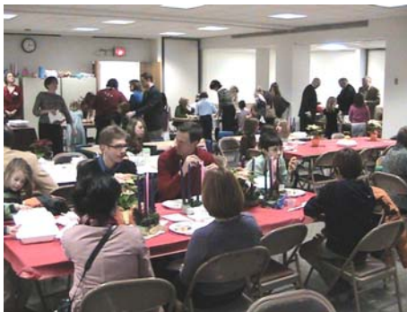
Enjoying the Advent Alive brunch