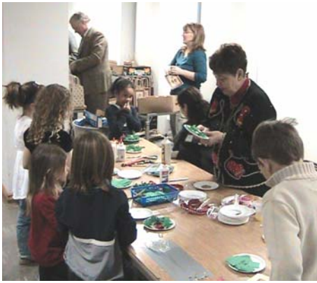
Making paper Advent wreaths