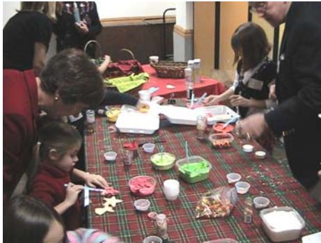
Decorating Christmas cookies