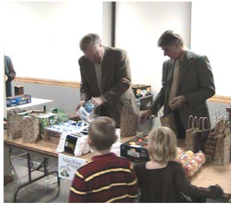
Filling gift bags for Dégagé Ministries