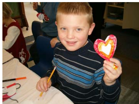
5 year olds made hearts to remember how much God loves them.

In February, Youth 5's and Kindergartners, 4 year olds and preschoolers, as well as 2 and 3 year olds will be hearing stories of Jesus' ministry—feeding the 5000, healings and calming a storm.