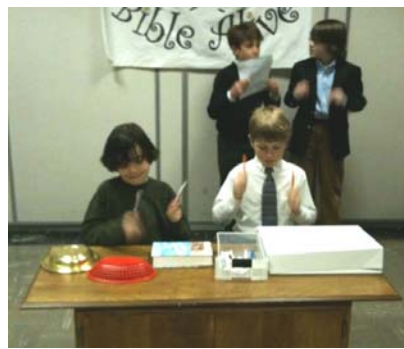
and music, making up our own rap about the fiery furnace.