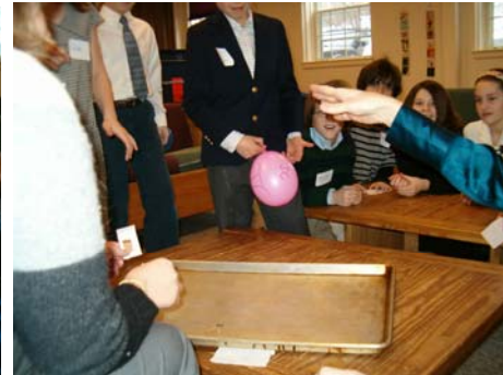
so there is no residue,