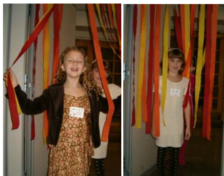
walking like Shadrach, Meshach and Abednego through the fiery flames,