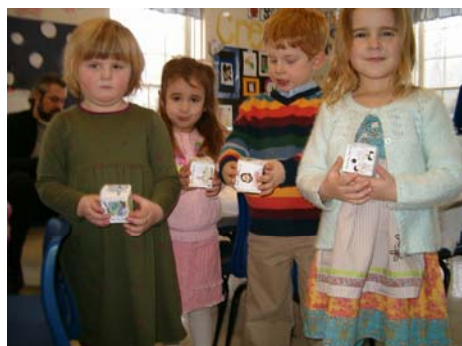
4 year olds made a prayer cube to help them remember all the things we can pray about.