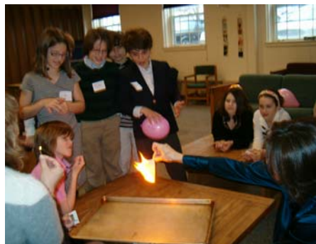
science, where God "burns up" our sins,