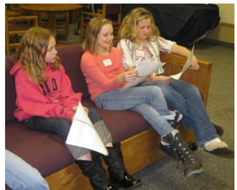
Reading along with the story

In our prayers the 3rd, 4th, and 5th graders shared times when they felt God's presence.