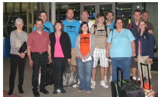
Eden Village Mission Team flying out of O'Hare, Chicago for Harare, Zimbabwe