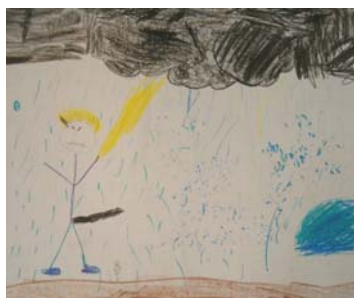
A light from heaven knocked him down and God spoke to him