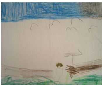
Saul is on the way from Jerusalem to Damascus to persecute Christians

In June the 4 year old/preschool Sunday School class heard the story of Saul's conversion and drew pictures to illustrate the drama of God and Saul/Paul.