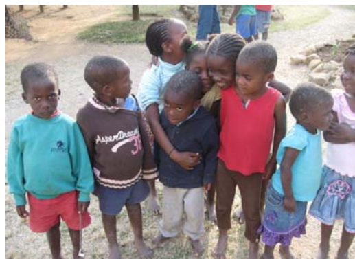
Children of Cottage #3 at Eden Children's Village