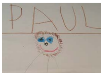
Friends helped him to Damascus where he was baptized, could see again, and was named Paul