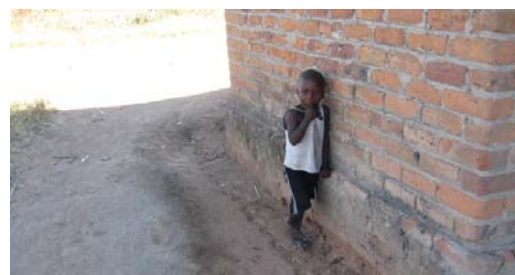
Zimbabwe orphans have no future without your help